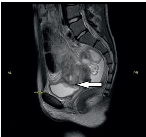
Fig 1: enterovesical fistula at diagnosis

Learn more on the medical management of fistulizing Crohn's disease by reading the Consensus Guidelines of ECCO/ESPGHAN on the medical management of Paediatric Crohn's disease https://doi.org/10.1016/j.crohns.2014.04.005