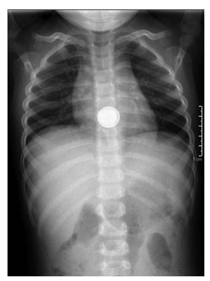
FIGURE 3. Halo sign.

unavailable because of another emergency intervention. Even in a large urban setting, parents will often present to a health facility without pediatric endoscopy available and as a result precious or crucial time can be lost. In such cases, early and frequent ingestion of honey, and if available, sucralfate in the clinical setting may have the potential to reduce injury severity and improve patient outcomes (31). It is, however, important to realize that available data are based on promising in-vitro and in-vivo studies of piglets while human studies are still lacking. The mechanism of action is thought to be not only coating of the battery and thereby limiting electrolysis but also neutralization of generated hydroxide as both honey and sucralfate are weak acids. Esophageal perforation is less likely in the first 12 hours after ingestion but this period does contain the peak of electrolysis activity and battery damage (32). Therefore, giving honey and/or sucralfate (1g/10mL suspension) might be considered within this time span. The advised dose for both is 10 mL (2 teaspoons) every 10 minutes with a maximum of 6 doses of honey and 3 doses of sucralfate, respectively (21,31).