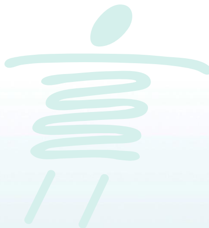
TREATING PHYSICIAN (Stamp)