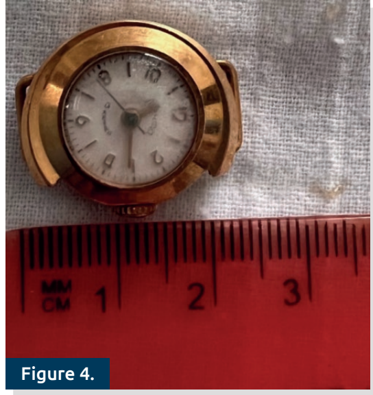
Figure 1. Primary X-ray: radio-opaque sharp object (clock) in the stomach.Figure 2. Control X-ray: radio-opaque sharp object (clock) in the same place.Figure 3. EGD photo: Clock in the stomach.Figure 4. Removed clock.